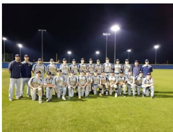
The JTHS Varsity Boys' Baseball Team during Spring Training in Fort Pierce, Florida.